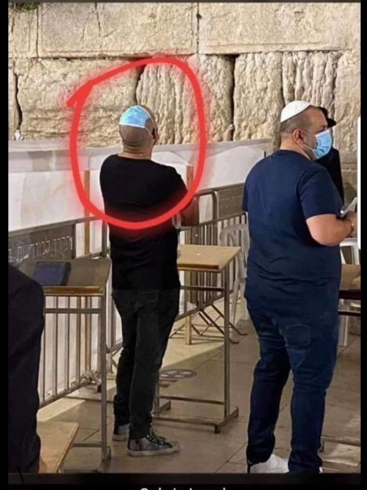
Only in Israel.