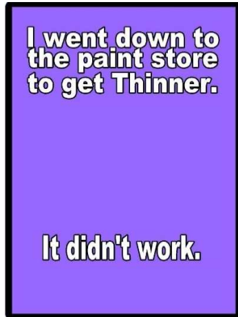
from Jai Cohen

George Burns: secret of good sermon: good beginning, good ending, two as close together as possible.