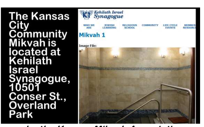
run by the Kansas Mikvah Association – Note the tile: Jerusalem Stone!