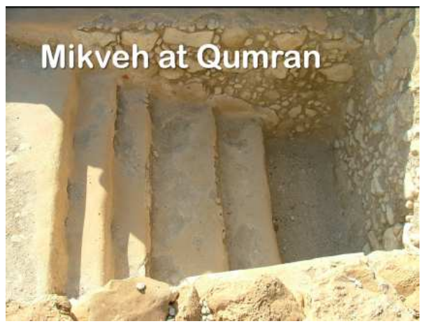
Essenes immersed themselves daily. But only after a year of learning the discipline of the life of an Essene.