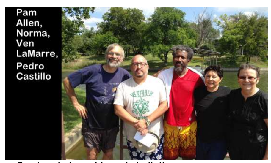
Tomorrow, 2:30 p.m., Gardner Lake, address in bulletin.

Following repentance and commitment to discipleship, faith in Messiah \rightarrow assurance of salvation