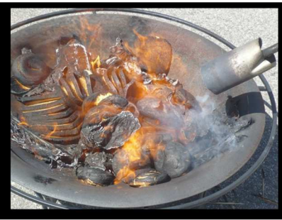
[https://upload.wikimedia.org/wikipedia/commons/7/74/BiurChametz2010.jpg We have a weed burner, otherwise known as a flame thrower, for hametz use if needed.]

Burning hametz on the morning before Passover, For us noon Fri. Mar. 26