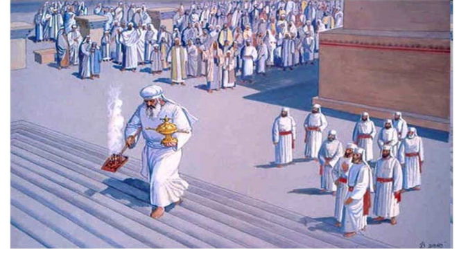
Yom Kippur use

The chalice is carried into the Sanctuary of the Temple, where the golden incense altar stands. Upon entering the Sanctuary the priest sounds the small ring-shaped bell seen on the top of the chalice cover.