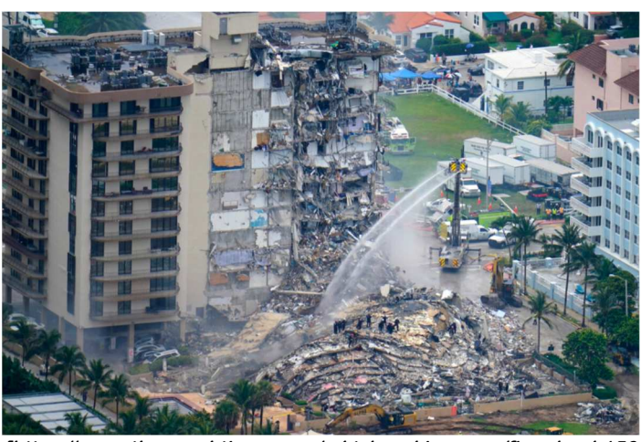
T'hillim/Ps 11.1-5 If the foundations are destroyed, what can the righteous do?"

Sometimes there are wounded people that challenge biblical norms until their wound and human intervention seem to totally undermine life