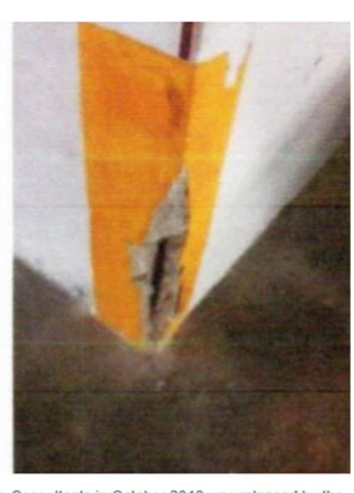
A nine-page report from structural engineering firm Morabito Consultants in October 2018 was released by the City of Surfside, warning about conditions in the building. It included photos of the cracking.

[https://www.theepochtimes.com/mkt_breakingnews/five-dead-156-missing-in-florida-building-collapse-as-sister-building-could-be-evacuated_3876139.html?utm_source=newsnoe&utm_medium=email&utm_campaign=breaking-2021-06-27-1&mktids=fd3634515b964b960d762725aa65defd&est=sQqQrtYsRft6LbO%2Fw%2FbY%2Fo7eM%2Bz7aFucBagkMPGdi3%2BrCNpNO09xAtVOAfbL38JhcQ%3D%3D]