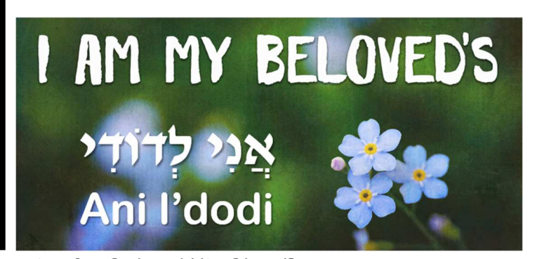
[TLV: I am my beloved's and my beloved is mine. Passion for G-d and His Glory!]

Elul אֱלוּל Beloved Song of Songs 6.3 I belong to the man I love, and he belongs to me. אַני לְדוֹדִי לְי חְדוֹדִי לִי \leftarrow אַלוּל \leftarrow אֱלוּל \leftarrow אֵלוּל \leftarrow אֵלוּל \leftarrow אַלוּל \leftarrow Anee I'dodi, v'dodi li