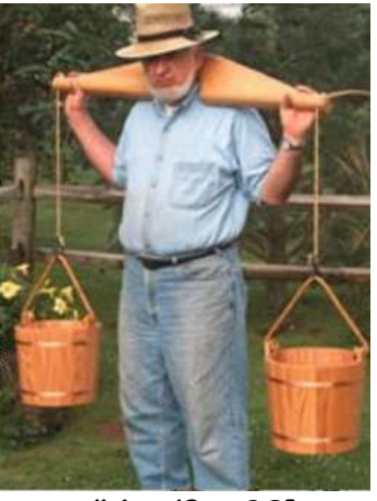
[Augmented burden bearing ... http://joshpelton.com/blag/?p=92]