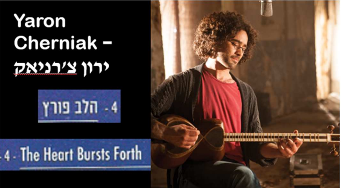
[apparently a Millennial]

https://www.mjai.co.il/product/praises-of-israel/