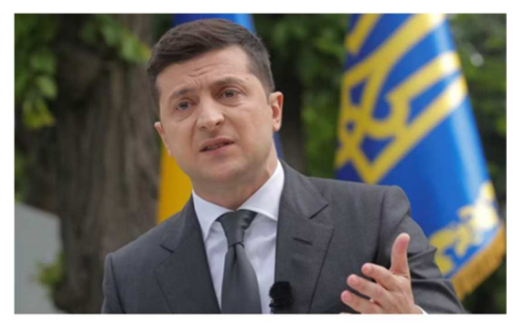
For Many Jews Watching Ukraine's War, Vlodymyr Zelenskyy is a 'Modern Maccabee'

[https://youtu.be/I7CfoDByXso]1.5-minute video We just don't know [https://vfinews.com/news/russia-strikes-babyn-yar-holocaust-memorial-site-in/for-many-jews-watching-ukraines-war-vlodymyr-zelenskyy]