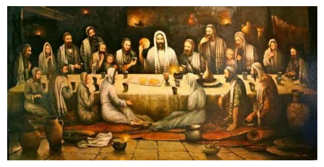
Triclinium table. Note reclining. Left out women and children.