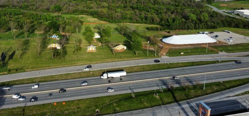
Will You Be 1 of 100 Million Intercessors for Israel? www.i49wall.com