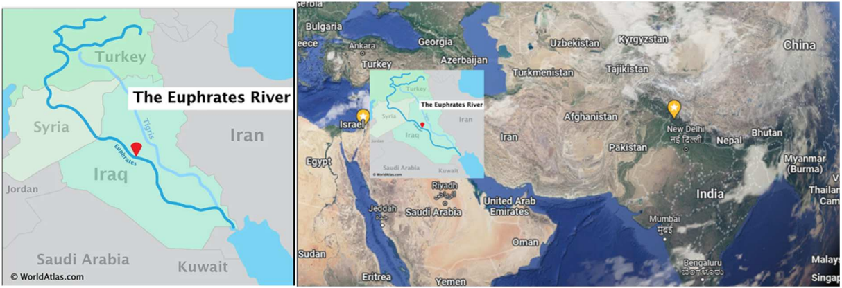
Rev 16.12 The sixth angel poured out his bowl <u>over the great river Euphrates; and its water was dried up</u>, to prepare the way for the <u>kings from the east</u>.