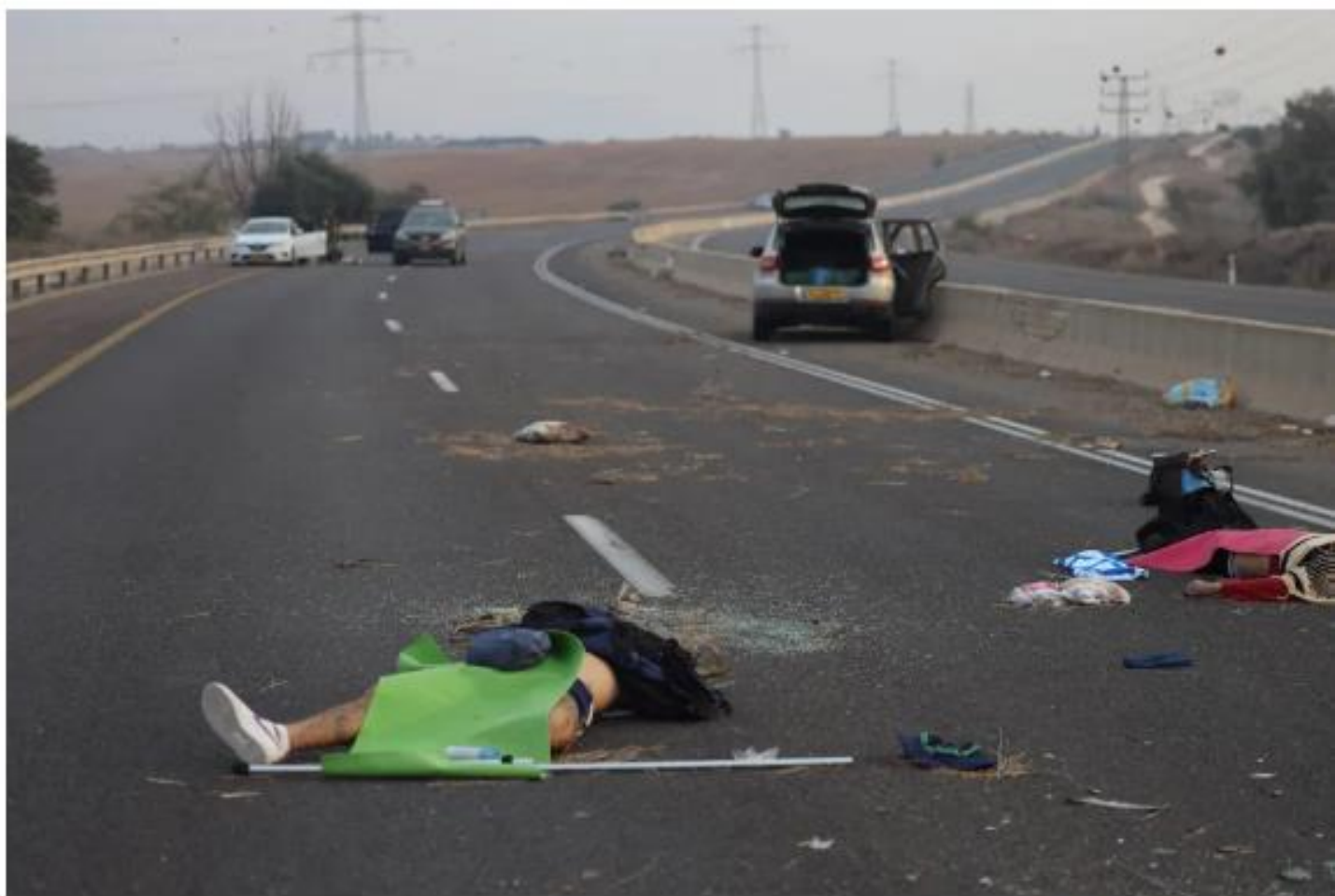
Israelis killed by Hamas militants on a road in Sderot, Israel, Saturday, Oct. 7, 2023.