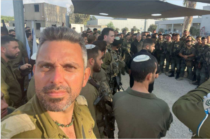
Prime Minister Netanyahu speaks with Chaim's men.

[ https://allisrael.com/proposals-weddings-births-israel-becomes-more-hopeful-and-jewish-davka-during-wartime ]