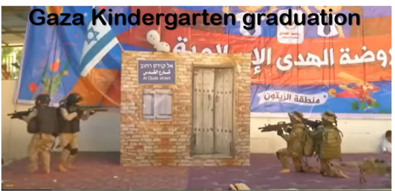
<u>https://youtu.be/dtErUuBvcRc?si=oEh6tH49YoLtSA3W</u> Threw a grenade in.