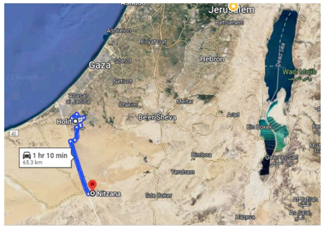
Note travel time.