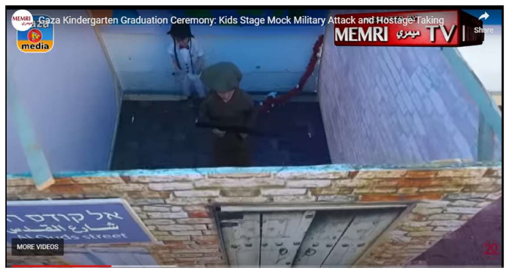
[Jewish father and child. Note Hebrew. El Kuds St. = Jerusalem St.