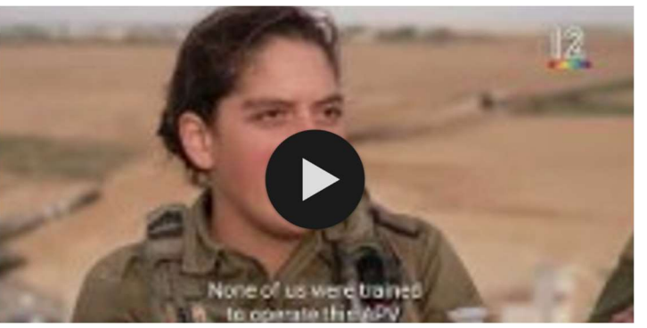
[https://www.youtube.com/watch?v=xjy0wpdSAI0] Showed in shul 0.47 to 6.59 Kibbutz Holit