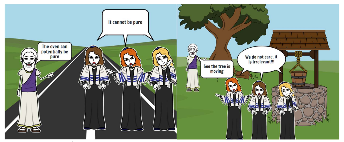
Bava Metzia 59b

[https://www.sefaria.org/Bava Metzia.59b.1?lang=bi]