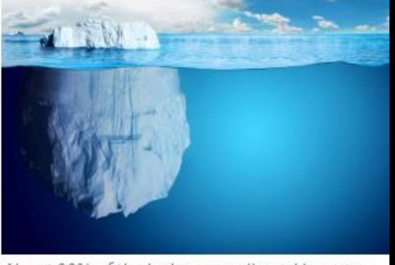
About 90% of the iceberg are dipped in water. Only the tip of the iceberg is above water and visible.