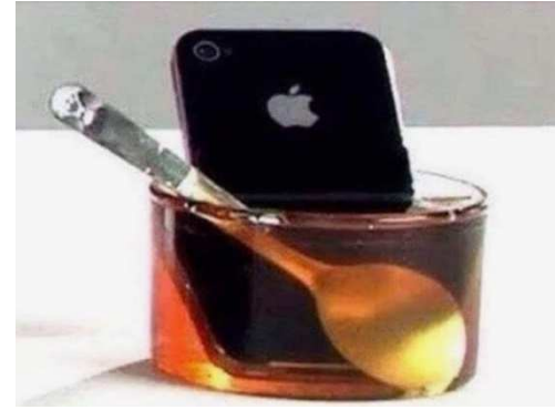
The newest innovation in Rosh HaShanah apples and honey.