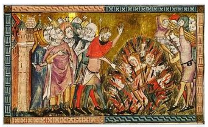
Jews being burned at the stake in 1349. Miniature from a 14th-century manuscript Antiquitates Flandriae by Gilles Li Muisis

1348: religious fervor and fanaticism bloomed in the wake of the Black Death, poisoning of wells by Jews as possible reasons for outbreaks.