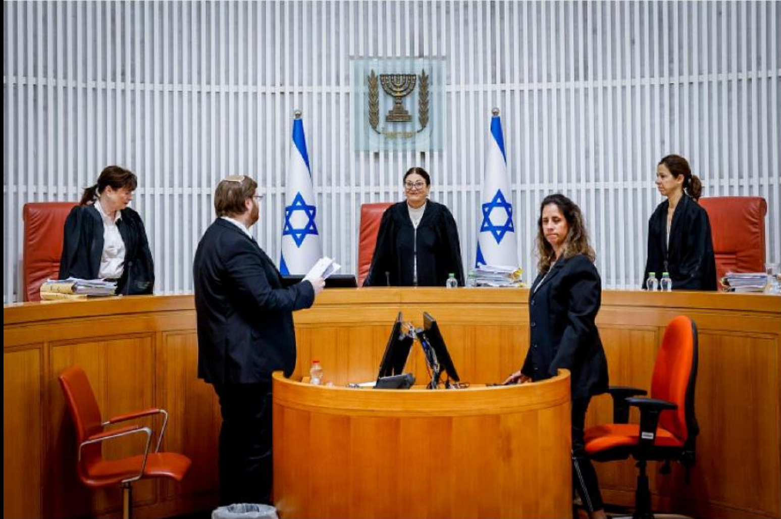
Supreme Court president Esther Hayut (center) arrives for a hearing, Dec. 8, 2022.