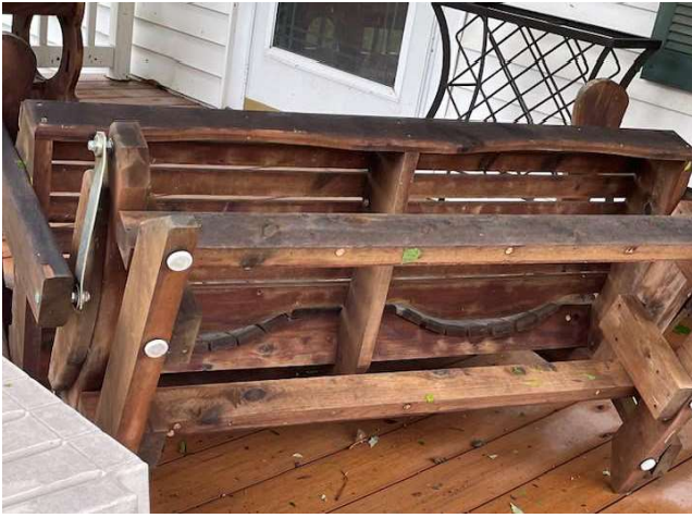
This is a very heavy Amish-made cedar glider. Trees are blocking both entrances to the barn. Storm flipped it over.