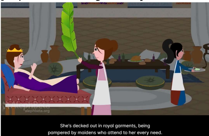
She's decked out in royal garments, being pampered by maidens who attend to her every need.

Ester 4.1,3 When Mordekhi learned everything that had been done, he tore his clothes, put on sackcloth and ashes and went out through the city, lamenting and crying bitterly...In every province reached by the king's order and decree, there was great mourning among the Jews, with fasting, weeping and wailing, as many lay down on sackcloth and ashes. [Empire wide seeking of G-d by the Jews. But Ester...]