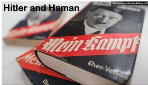
Hitler and Haman

Dvarim/Dt 25.17-19 “Remember what ‘Amalek did to you on the road as you were coming out of Egypt, how he met you by the road, attacked those in the rear, those who were exhausted and straggling behind when you were tired and weary. He did not fear God. Therefore, when Adoni your God has given you rest from all your surrounding enemies in the land Adoni your God is giving you as your inheritance to possess, you are to blot out all memory of ‘Amalek from under heaven. Don't forget!