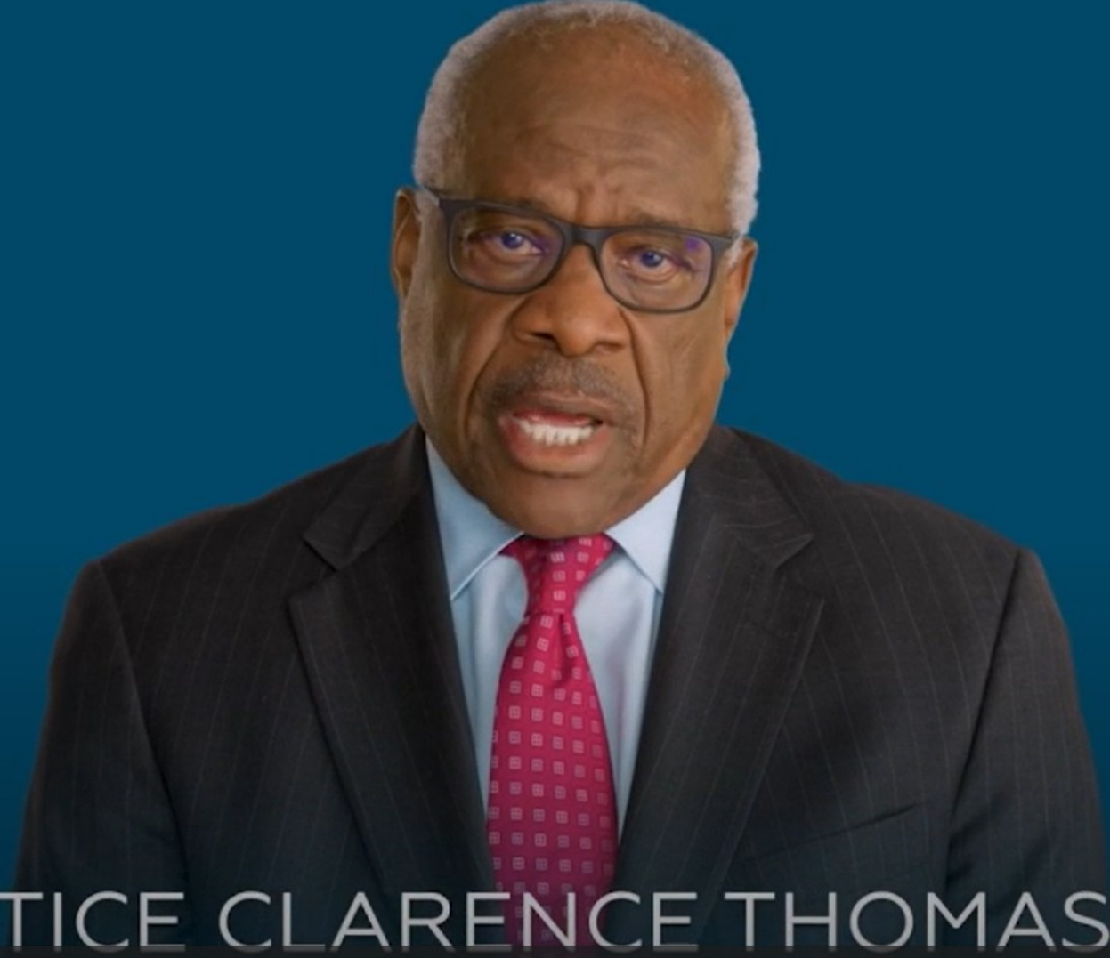
JUSTICE CLARENCE THOMAS