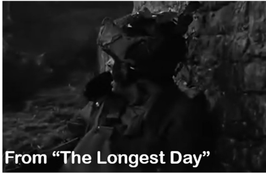
From "The Longest Day"

Rev 12.10 The accuser of our brothers and sisters—the one who accuses them before our God day and night.