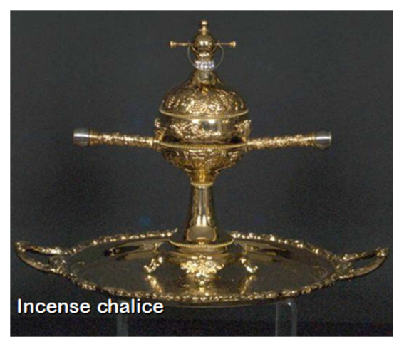
[This is not in the scripture, but in the Temple Institute's depiction of the incense procedure. Lots of details of worship unknown without Oral Law/Talmud.]